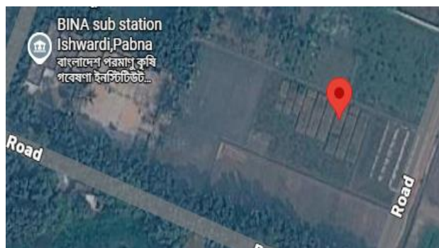
Figure 1: Experimental site

This field research, to the study of the effect of PGPR and chemical fertilizer on the yield of Mung bean, was conducted at BINA Sub-station, Ishurdi (24°07'23.6"N 89°04'50.0"E) during the Kharif season of 2022.