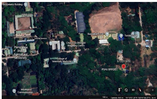
Figure 1. Study Site

The research was carried out at PSAU Bamboo and Rattan RDE Center (15°13'07.20"N 120°41'46.21"E) of Pampanga State Agricultural University (PSAU), situated in San Agustin, Magalang, Pampanga (Figure 1).