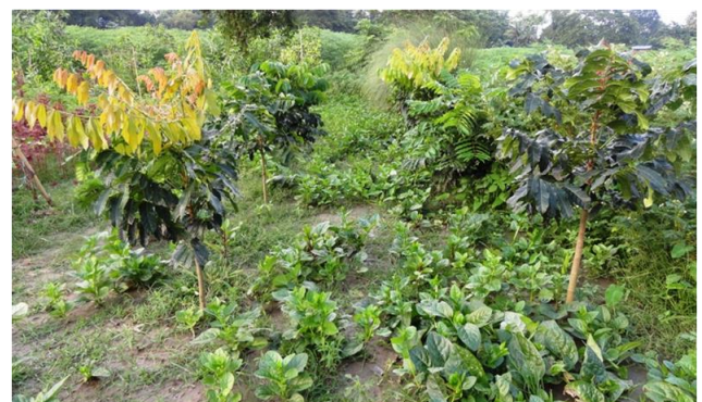
Fig. 3. Indian spinach cultivation along with Lombu tree

Indian spinach was cultivated under different distance from the Lombu tree base. Different growing parameters such as plant height, leaf numbers per plant, leaf size, twigs number per plant, weight of leaves per plant, weight of stems per plant and leaf stem ratio were significantly influenced by different distances from tree base (Fig. 3). Except plant height and leaf stem ratio all others growing parameters were highest in open field condition and lowest in 0.0-2.5 feet distances from the tree base at every five harvesting time (Table 1).