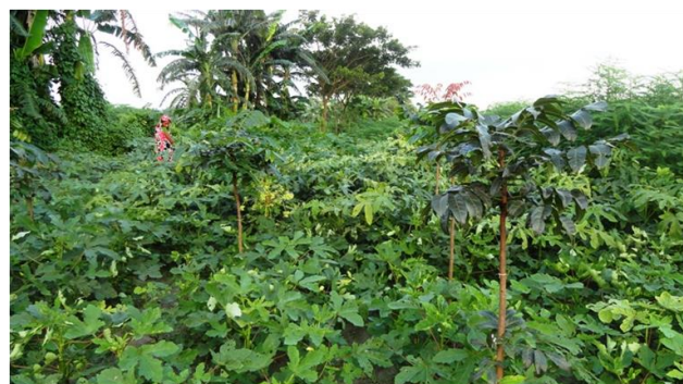
Fig. 4. Okra cultivation along with Lombu tree

Morphological behavior/characteristics and yield of Okra along with Lombu tree significantly influenced in different distances from tree base (Fig. 4).